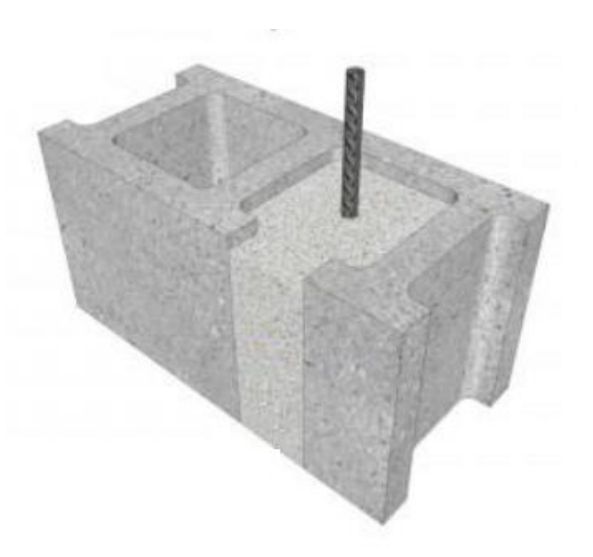
Figure 2: Sawcut vertical rebar in existing masonry core from IMI Masonry Detail Series <u>http://imiweb.org/masonry-detailing-series/</u>

Installation of horizontal reinforcement into an existing masonry wall can be difficult depending on the existing conditions. First, verify gravity loading conditions and determine if temporary shoring is required for point loads or if needle shoring is required to support the upper portions of the wall while the retrofit work is performed. If the existing wall does not contain vertical reinforcement, then the faceshells and interior webs could be removed with horizontal saw cuts(intermittent cutting may be desired to lessen